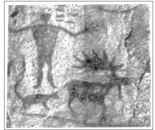
Irene DeLaby is one of the founders of Friends of Florida State Parks and long time volunteer.

The land we purchased is near North Hegman and South Hegman Lakes. The pictograph site may well be the best in the area and most easily visited in Canoe country. They are located on a dome of black granite painted on pinkish granite framed by black stains and lichen. We do not understand the illustration but are a real part of Ojibwa lore.