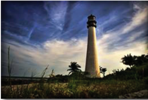
Cape Florida Lighthouse by Iouri Dovnarovich Bill Baggs Cape Florida State Park, Key Biscayne, FL

Nature-based photography is one of the fastest growing activities in America. In Florida, that holds true. Each month, between 40 and 200 photos are entered into the monthly Photo Contest online. Visitors to the site vote for the winner. Each of the 12 monthly winners is eligible for the Annual Contest.