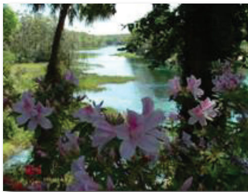
Rainbow Springs Rainbow Springs State Park, Dunnellon, FL

The prizes were either a two-night stay at a cabin in any Florida State Park that offers cabin accommodations or hotel accommodations near a Florida State Park. Florida State Parks partnered with the Friends of Florida State Parks to provide the prizes.